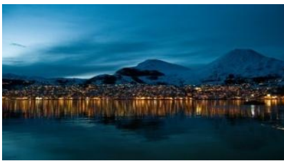
Atlantic , Risteard O'Domhnaill, Ireland, trailer .