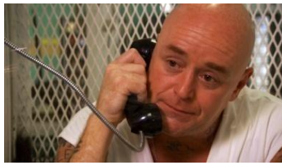
An Eye for an Eye , Ilan Ziv, Israel/Canada, trailer .